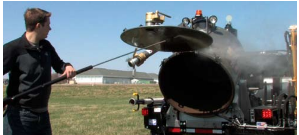
Easy clean up and dumping