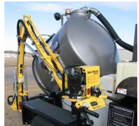
Valve & Vac unit when teamed with HURCO's Spin Doctor valve and hydrant exerciser.