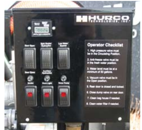
Easy-to-operate control panel