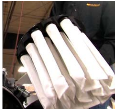
Microfiber filtering system